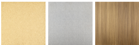
Brushed Gold Brushed Nickel Brushed Brass