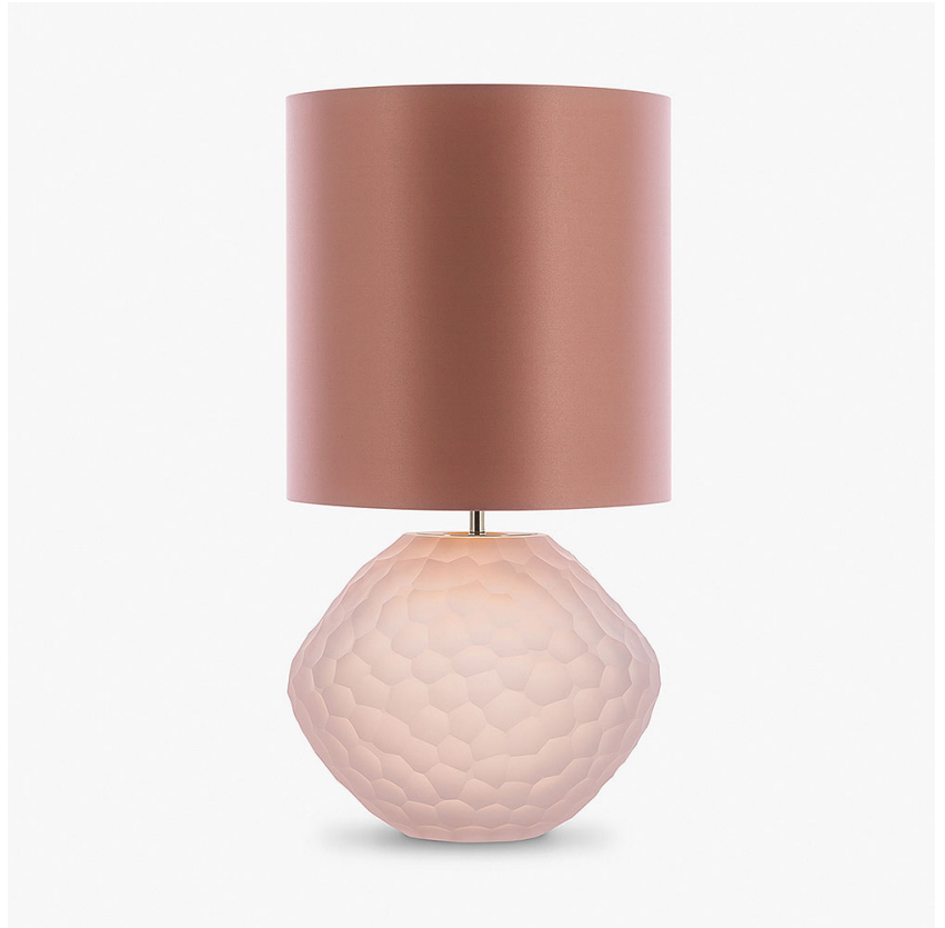
TL234 in Blush pink glass and brushed nickel with a 11" tall drum shade in Crepe satin 1806W 22 India

Atacama, Chile, is one of the driest areas in the world and within this remote desert lies beauty of ethereal quality. An extra-terrestrial landscape of pink birds and imposing, eerie pockets of water bubbling and jets of steam bursting into the sky. Most unusual of all is the vast white jigsaw spanning as far as the eye can see, the salt flats of Atacama. Our new design of the same name retraces the natural pattern scored through this salt mosaic in a delightful array of glass colours. Finish note as these glass lamps are handmade by our artisans in England, they may vary from piece to piece slightly in dimension and appearance.