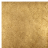
Antique Gold Leaf