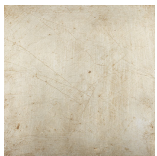
Antique Silver Leaf