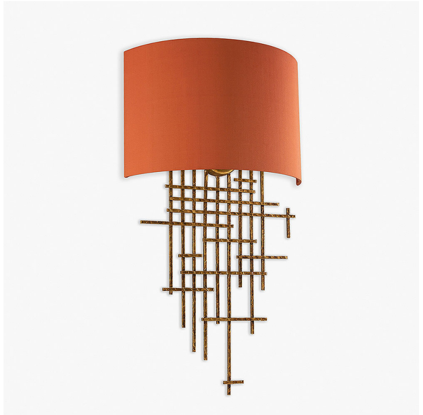
WL59 in Hammered Antique Gold Leaf with a 15" Oval Drum Shade in 5018W/ 553

"I wish to approach truth as closely as is possible, and therefore I abstract everything until I arrive at the fundamental quality of objects." — Piet Mondrian Mondrian's Pier and Ocean series describes a gradual abstraction of a waterfront scene, simplifying oblique and indistinct details into parallel, rhythmic lines, which describe the pulse of the ocean. Our Mondrian family is heavily influenced by this astute observation of the underlying patterns in nature and the unending movement of water, drawing on these qualities of order and balance to create these sculpted pieces. This design is available in a mirrored pair.