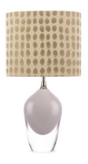
BODICE TABLE LAMP

TL663 BALLET 8. PEWTER 16CM [6.3"] WIDE X 12CM [4.7"] DEEP X 36.5CM [14.4"] HIGH SHOWN WITH 12" OVAL DRUM SHADE