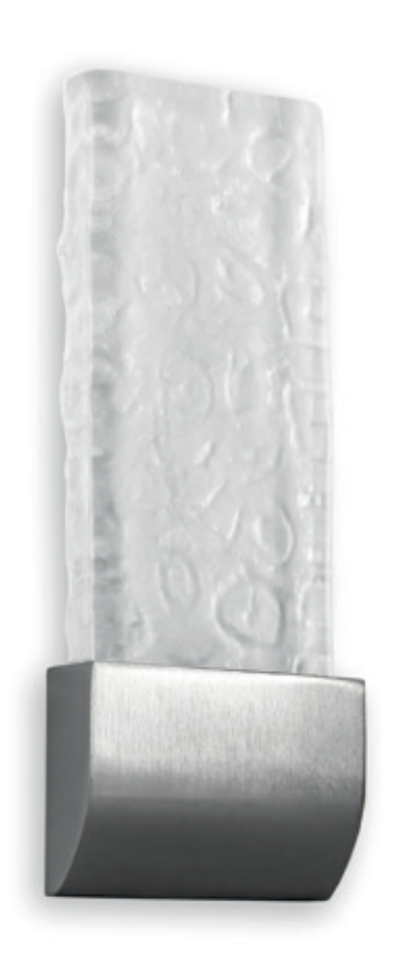
MOONLIGHT WALL LIGHT

The Moonlight wall light's glass facet is imprinted with features which resemble craters of the Moon's surface. Soft beams of light emanate from beneath the glass print, hitting the relief of the pattern and mimicking the chiaroscuro stillness of the Moon. Built-in LEDs are concealed within a sleek, minimalistic compartment with magnetic fastenings which are invisible from the outside, making sure nothing distracts the eye from the beauty of the shadows.