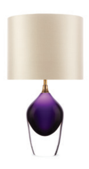
BODICE TABLE LAMP