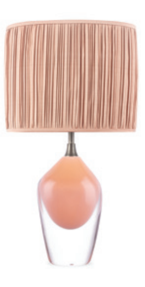
BODICE TABLE LAMP

TL663 BALLET 8. PEWTER 16CM [6.3"] WIDE X 12CM [4.7"] DEEP X 36.5CM [14.4"] HIGH SHOWN WITH 12" OVAL DRUM SHADE