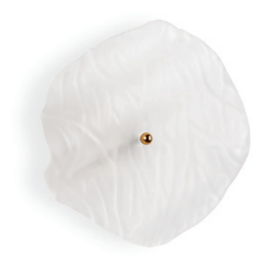
RUFFLE LARGE WALL LIGHT

Echoing the design language of the ceiling lights, we offer two wall light styles to complement our Ruffle collection. A single backlit plate from our large chandelier offers a petite wall adornment which can be grouped in flowing sequences or is beautiful individually. As with the ceiling light, the gently scrunched glass is organically formed and each piece is unique. Alternatively, a cluster of our delicate, smaller plates with integrated LEDs makes for a dainty room accessory.