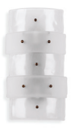
LUNAR WALL LIGHT

CLEAR & SATIN GLASS & POLISHED NICKEL 125CM [49.2"] WIDE X 24CM [9.4"] DEEP X 23.5CM [9.3"] HIGH