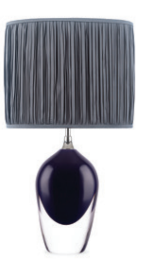
BODICE TABLE LAMP

TL663 RAINCLOUD & POLISHED NICKEL 16CM [6.3"] WIDE X 12CM [4.7"] DEEP X 36.5CM [14.4"] HIGH SHOWN WITH 12" OVAL DRUM SHADE