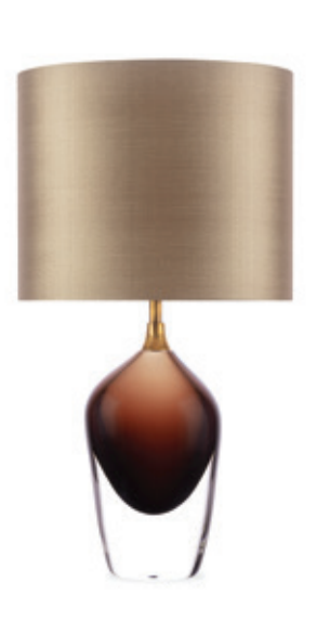
BODICE TABLE LAMP