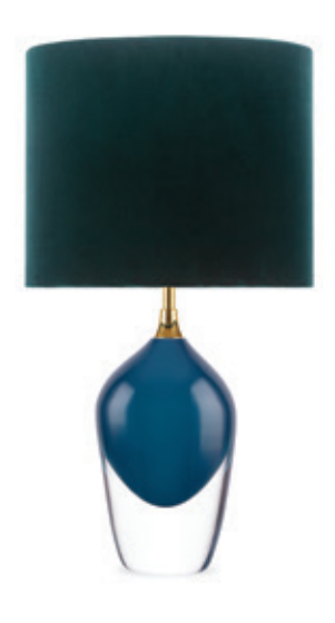
BODICE TABLE LAMP

The Bodice table lamp is the English Rose of this latest collection; a feminine personality composed of elegance and beauty with an unmistakably graceful demeanour. This table lamp is comprised of a mouth blown body of glass and a solid, spun brass neck, both deftly crafted in the south of England