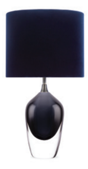
BODICE TABLE LAMP

The Bodice table lamp is the English Rose of this latest collection; a feminine personality composed of elegance and beauty with an unmistakably graceful demeanour. This table lamp is comprised of a mouth blown body of glass and a solid, spun brass neck, both deftly crafted in the south of England.