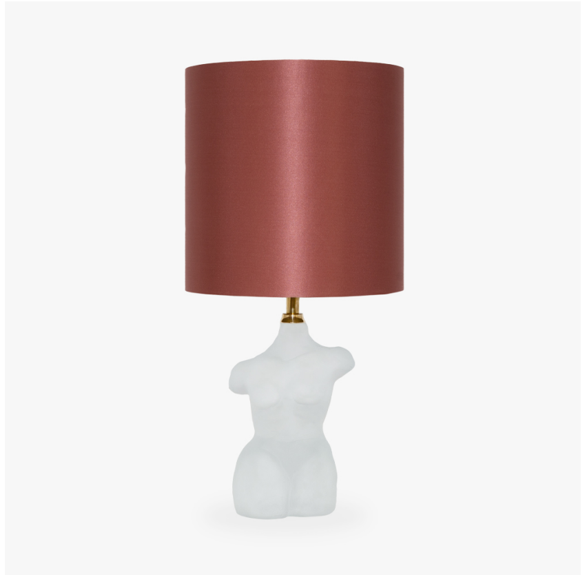
TL814 in Frosted Glass and Polished Brass with 9" Tall Drum Shade in Bennett's 1806/306