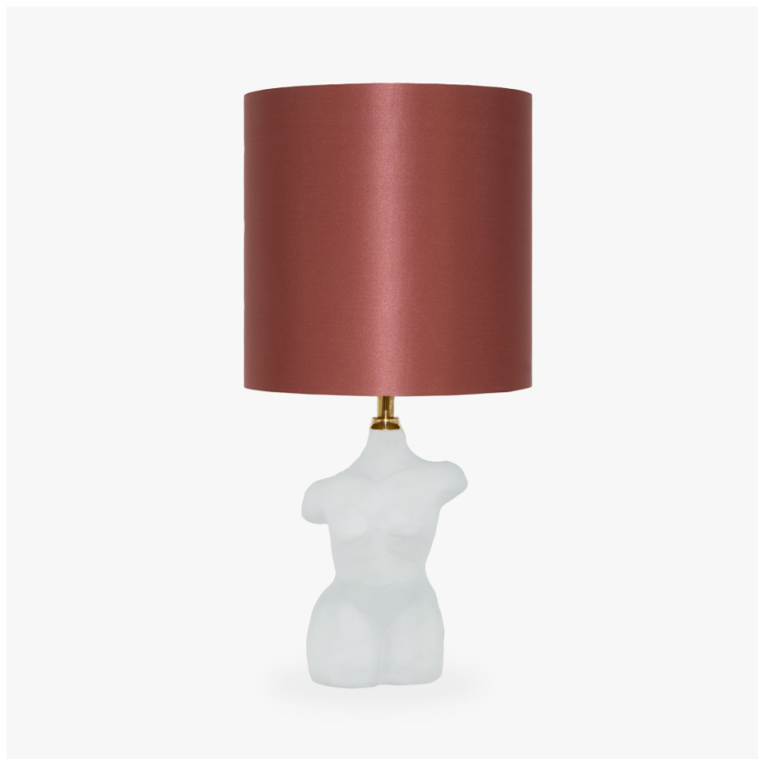
TL814 in Frosted Glass and Polished Brass with 9" Tall Drum Shade in Bennett's 1806/306