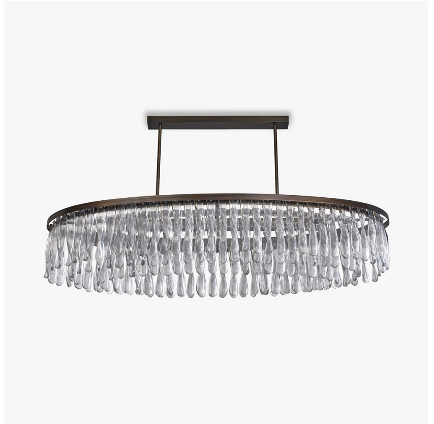
CL464-3T-O-160 in Clear and Brushed Bronze