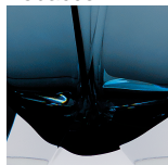
Petrol Blue & Clear