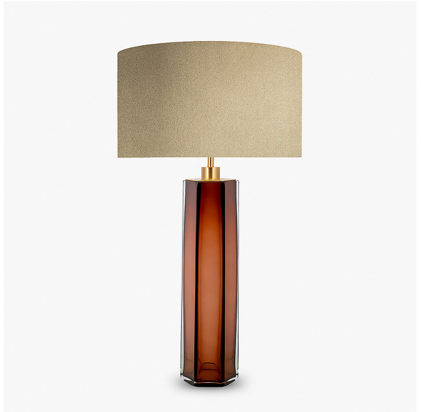
TL704-LA in Tobacco & Clear Murano Glass with a 16 Inch Tall Drum Shade in Silk Dupion 5018W/ 03