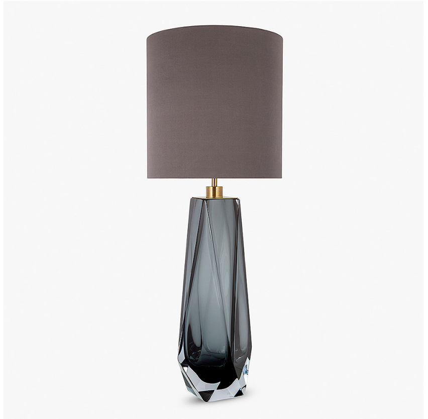
TL703-XL in Petrol Blue & Clear Murano Glass with a 13" Tall Drum Shade in Silk Dupion 5018W-86