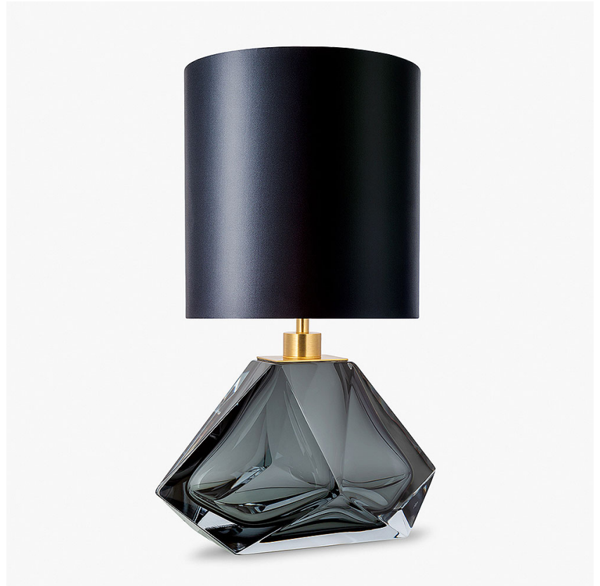
TL700 in Petrol Blue with a 11" Tall Drum Shade in Silk Crepe Satin 1806W/ 019 Indian Ink