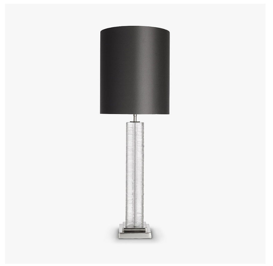
TL290 in Clear and Polished Nickel with 11" Tall Drum in Silk Crepe Satin 1806W-21