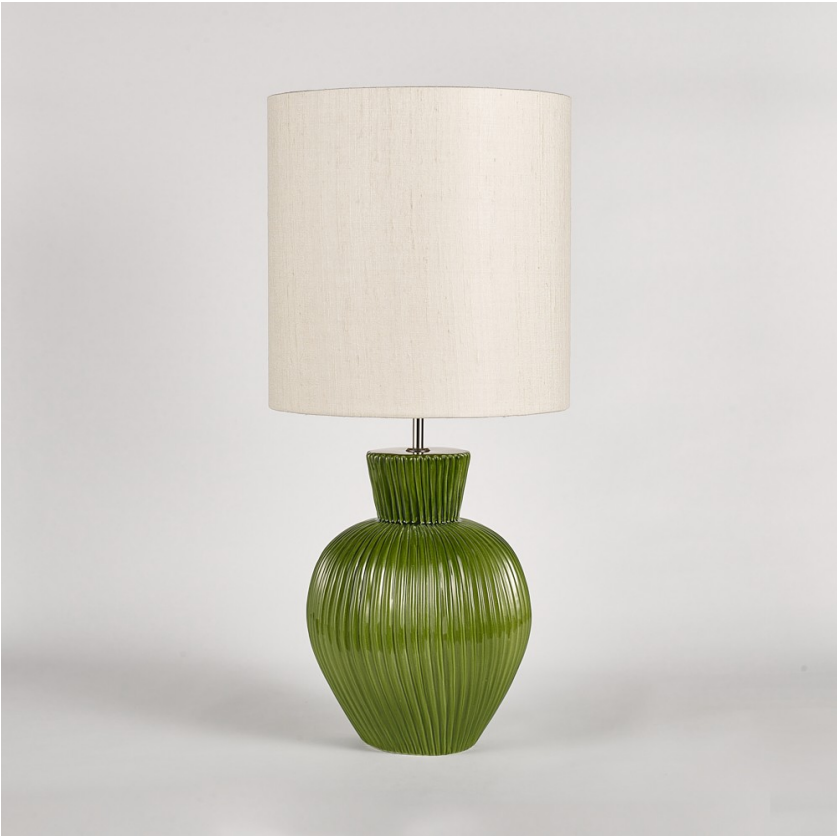
TL160 in Ivy and Polished Nickel with 13" Tall Drum Shade in James Hare Vienne Silk Chalk 31458/01