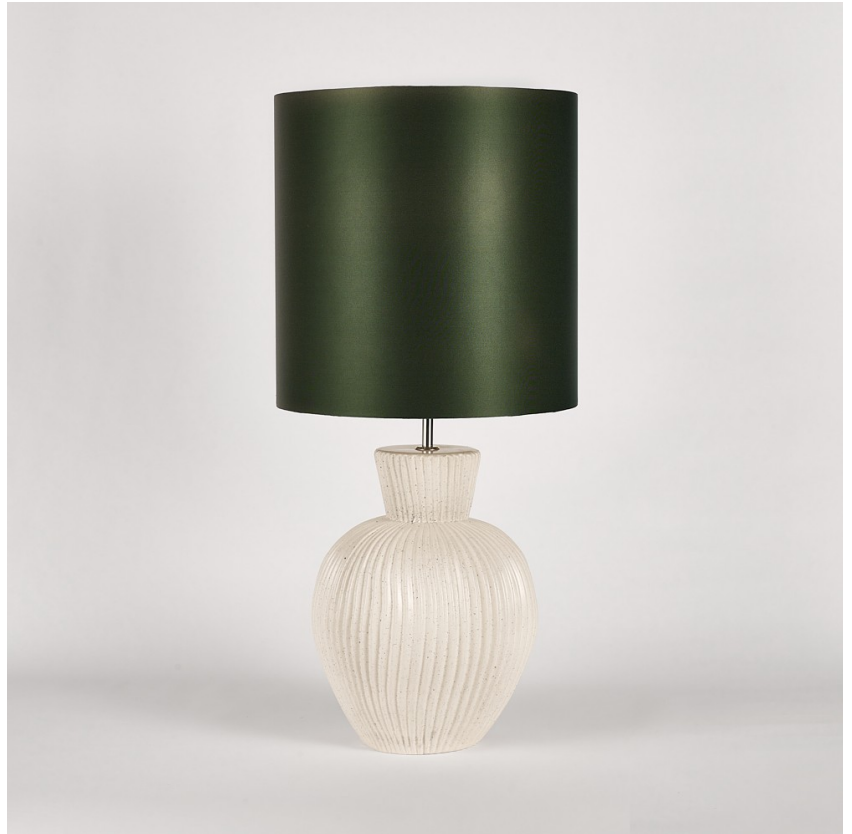
TL160 in Jasper and Polished Nickel with 13" Tall Drum Shade in Bennett's Crepe Satin Dill 1806W/120