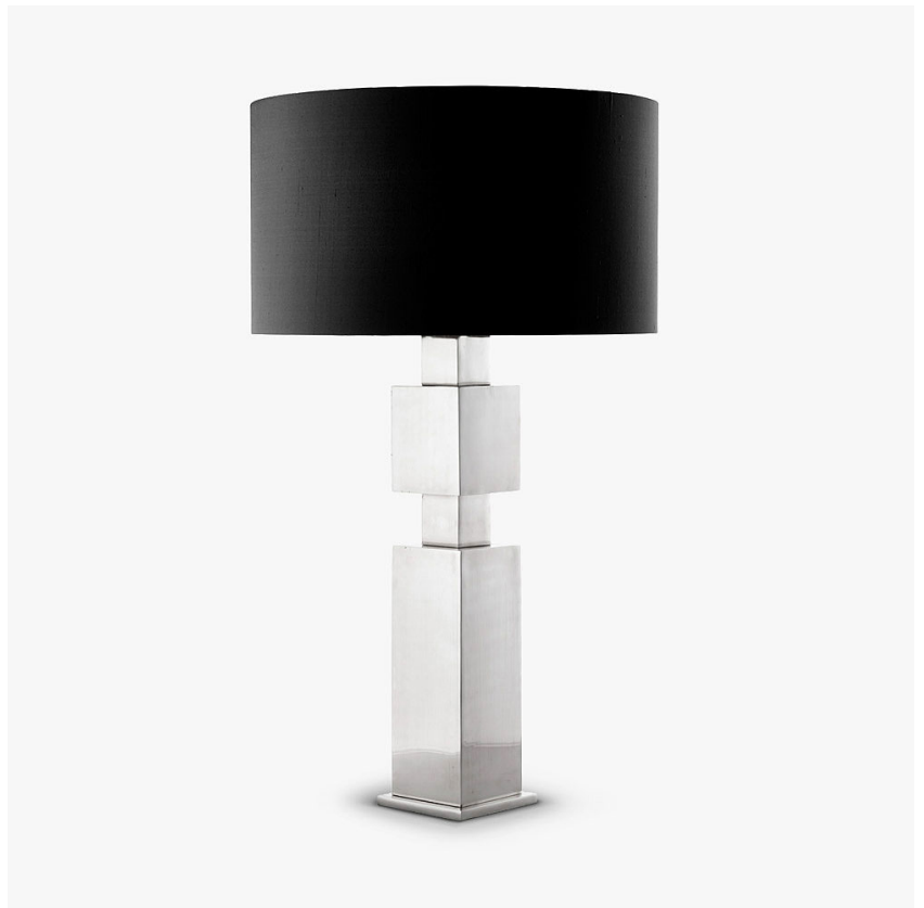
TL750 in Brushed Nickel with a 11 Inch Tall Drum Shade in Silk Crepe Satin 1806W/21 Slade

IEC (International Electrotechnical Commission) test certificates available - will incur a surcharge UL (Underwriters Laboratories) test certificates available for the USA - will incur a surcharge