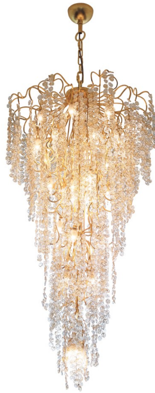
CL645-T-95 in Clear and Amber Murano Glass and Gold Leaf

IEC (International Electrotechnical Commission) test certificates available - will incur a surcharge UL (Underwriters Laboratories) test certificates available for the USA - will incur a surcharge