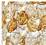
Clear & Amber