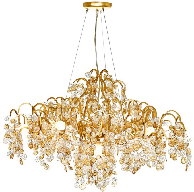
CL645-85 in Clear and Amber Murano Glass and Gold Leaf

IEC (International Electrotechnical Commission) test certificates available - will incur a surcharge UL (Underwriters Laboratories) test certificates available for the USA - will incur a surcharge