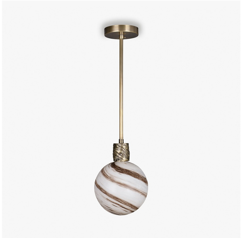
CL855-PEN in Maple and Brushed Bronze

Our Storm Pendant captures the natural beauty of swirling patterns and organic textures, inspired by the dynamic movement of white-water rapids and powerful storms. Each glass globe is individually hand-blown, creating a unique marbled effect that mirrors the energy and motion of a storm. Suspended from a finely detailed metal collar with swirling textures, the Storm Pendant blends bold design with timeless elegance. Its dramatic aesthetic brings artistry and sophistication.