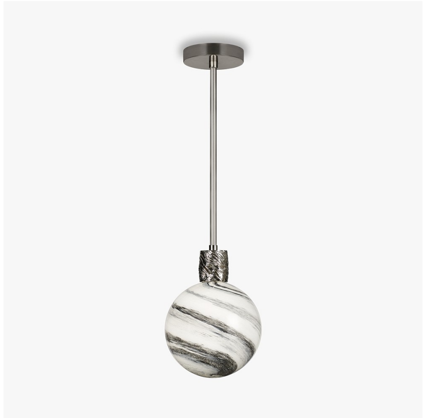
CL855-PEN in Andesite and Brushed Nickel

Our Storm Pendant captures the natural beauty of swirling patterns and organic textures, inspired by the dynamic movement of white-water rapids and powerful storms. Each glass globe is individually hand-blown, creating a unique marbled effect that mirrors the energy and motion of a storm. Suspended from a finely detailed metal collar with swirling textures, the Storm Pendant blends bold design with timeless elegance. Its dramatic aesthetic brings artistry and sophistication.