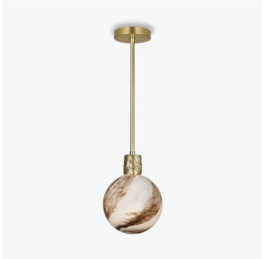
CL855-PEN in Maple and Brushed Gold

Our Storm Pendant captures the natural beauty of swirling patterns and organic textures, inspired by the dynamic movement of white-water rapids and powerful storms. Each glass globe is individually hand-blown, creating a unique marbled effect that mirrors the energy and motion of a storm. Suspended from a finely detailed metal collar with swirling textures, the Storm Pendant blends bold design with timeless elegance. Its dramatic aesthetic brings artistry and sophistication.