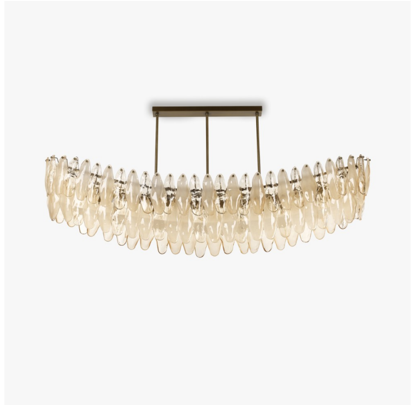
CL850-CO in Champagne and Champagne Satin with Brushed Bronze

The presence of energy and movement cannot always be explained; a phantom, a mirage or a ghost. Our Spectre range takes on a somewhat ethereal form with its amorphous shapes and diaphanous presence. Created from a new suspended glass fixing, the Spectre ceiling lights appear to hover in mid-air and hint at the vestige of energy where life may once have been. Offered in a mix of clear glass with spectral satin glass elements, the dappled light effect that this creates disrupts any defined outline and produces a softness and a gentle vision for your interior setting. In a design first for Bella Figura, this variation of the classic round design is available in a unique curved oval shape that evokes images of an other-worldly ghost ship cutting through uncharted waters.