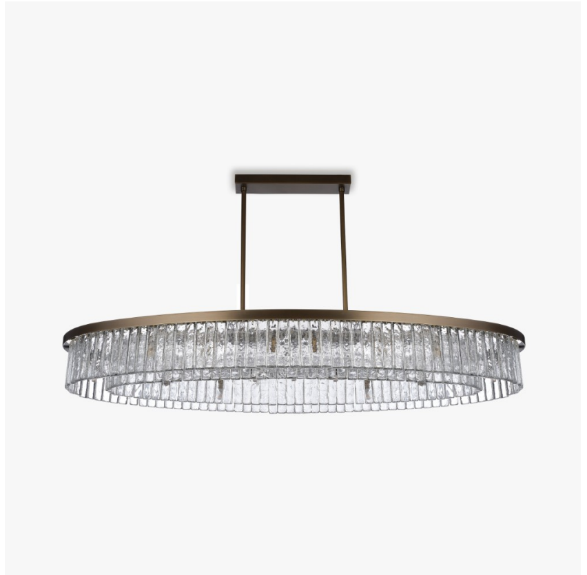
CL443-SM-O-150 in Clear Crackled and Brushed Dark Bronze