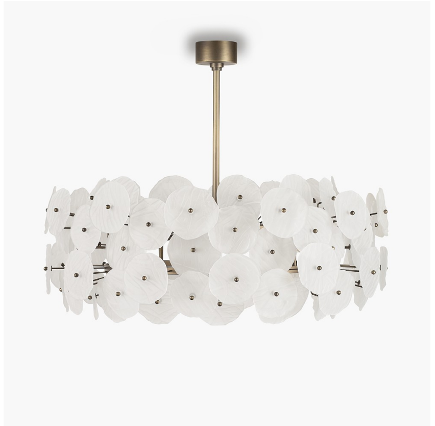
CL207-SM-100 in Satin and Brushed Bronze