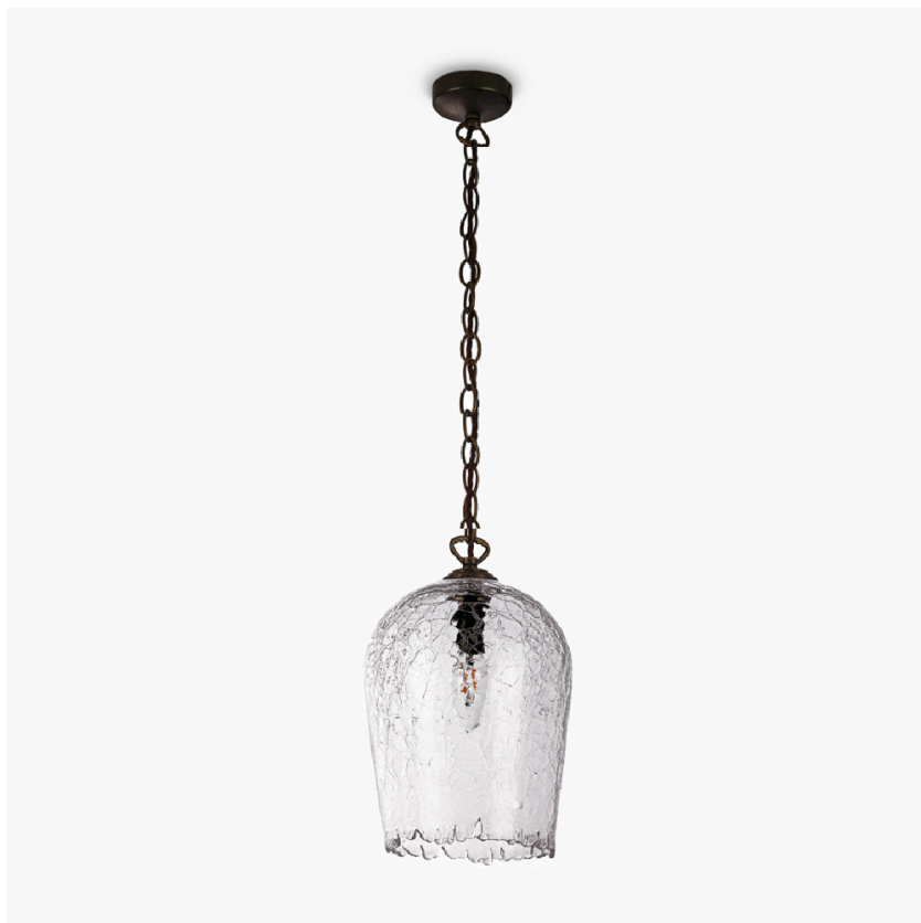
CL52-LA in Clear Crackled Glass and Old English Brass Chain