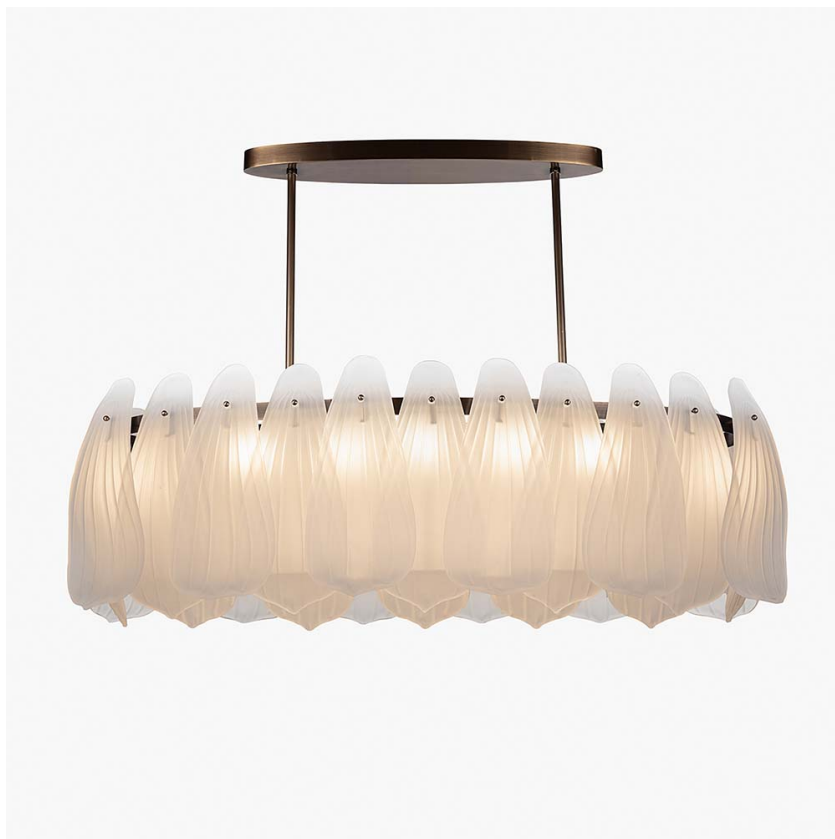
CL214-125 in Satin and Brushed Bronze