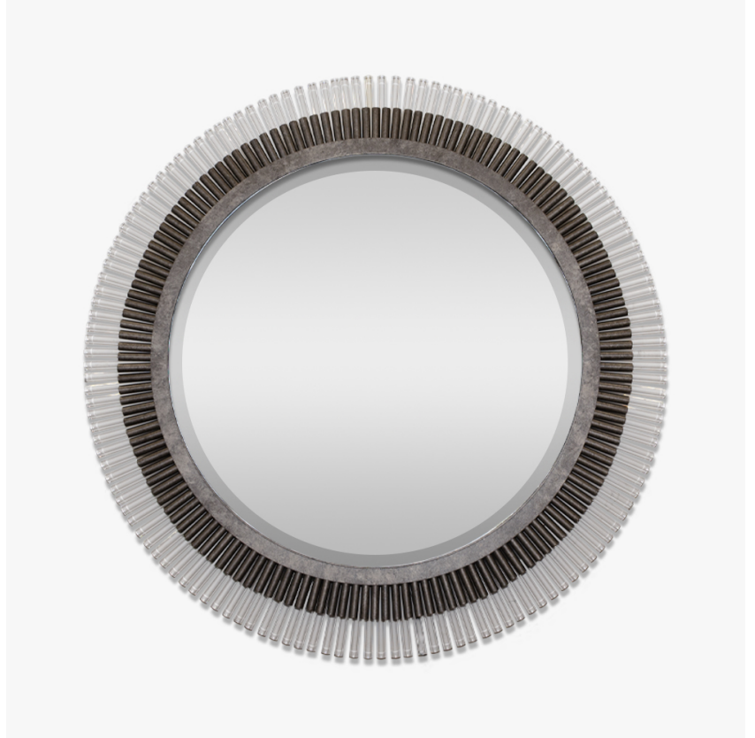
Pimlico Mirror in Stippled Silver and Clear Lucite

Originally a variation of our Battersea Chandelier, this revision of our popular Pimlico Chandelier will become the centerpiece of any space. Featuring an optional eco-friendly LED strip round the mirror's circumference, a warm halo effect is created by the illumination through the clear lucite rods.