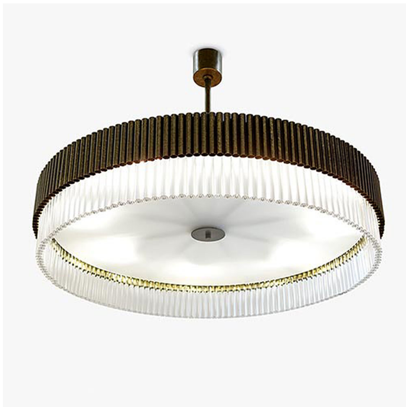
CL108-100 in Clear Lucite Rods and Stippled Bronze

IEC (International Electrotechnical Commission) test certificates available - will incur a surcharge