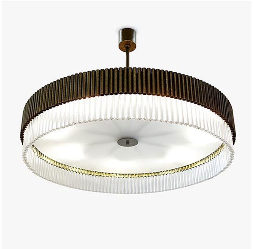
CL108-100 in Clear Lucite Rods and Stippled Bronze

IEC (International Electrotechnical Commission) test certificates available - will incur a surcharge