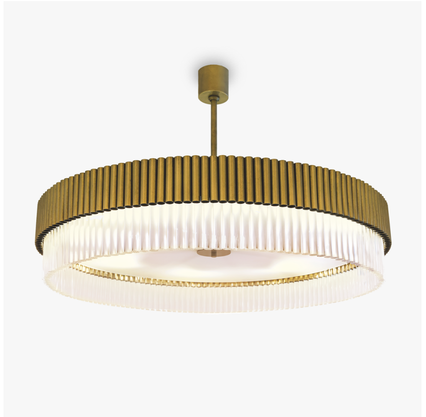
CL108-100 in Clear Lucite Rods and Stippled Gold Rods

UL (Underwriters Laboratories) test certificates available for the USA - will incur a surcharge Suitable for Yachts - Rod and bolting available for use on yachts