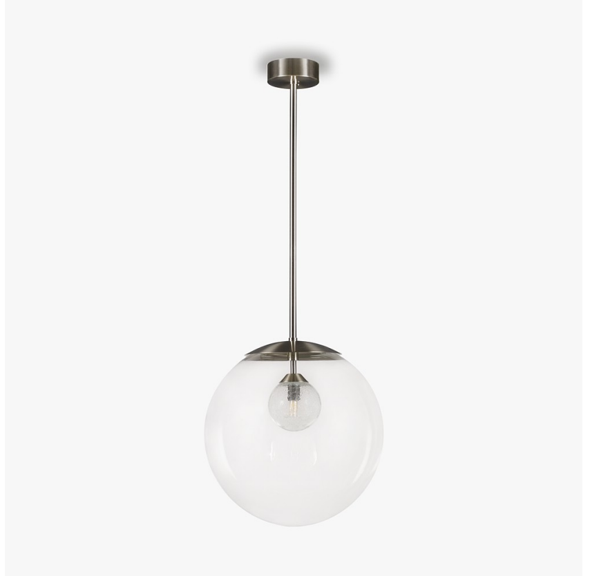
CL854-PEN in Clear and Brushed Nickel

The Orbis pendant lights combine timeless sophistication with modern artistry. Featuring meticulously crafted glass spheres with a beautiful inner glass globe design feature, inspired by celestial orbits and the beauty of planetary motion, the Orbis Pendant evokes a sense of weightless elegance, with its luminous glass spheres appearing to float effortlessly. These pendants are available in three finishes: Olive, Cacao, and Clear. The pendants embody the perfect balance of design and functionality, making them an exceptional addition to any décor. Whether suspended individually for understated elegance or clustered together to create a dramatic statement, the Orbis Pendants radiate a warm and inviting glow. Perfect for living areas, dining spaces, or grand entrances, they add a contemporary touch while enhancing the atmosphere of any interior.