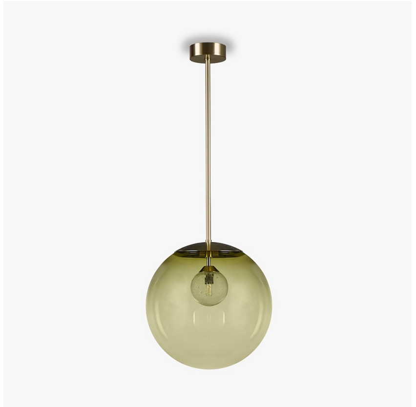
CL854-PEN in Olive and Brushed Gold

The Orbis pendant lights combine timeless sophistication with modern artistry. Featuring meticulously crafted glass spheres with a beautiful inner glass globe design feature, inspired by celestial orbits and the beauty of planetary motion, the Orbis Pendant evokes a sense of weightless elegance, with its luminous glass spheres appearing to float effortlessly. These pendants are available in three finishes: Olive, Cacao, and Clear. The pendants embody the perfect balance of design and functionality, making them an exceptional addition to any décor. Whether suspended individually for understated elegance or clustered together to create a dramatic statement, the Orbis Pendants radiate a warm and inviting glow. Perfect for living areas, dining spaces, or grand entrances, they add a contemporary touch while enhancing the atmosphere of any interior.