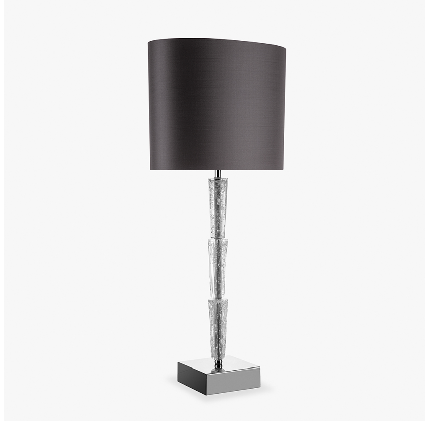
TL212 Nilssen in Brushed Nickel with a 12" Oval Shade in James Hare 31519/09