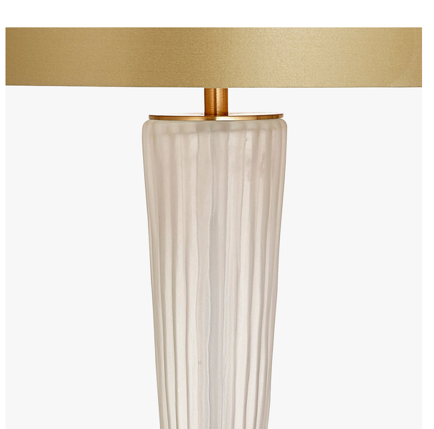
TL658 in Clear and Brushed Gold with 15" Drum Shade in Silk Crepe Satin 1806W-0732 Moss