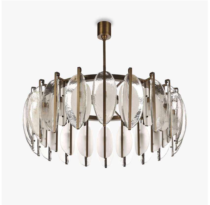
CL852 in Clear and Brushed Bronze