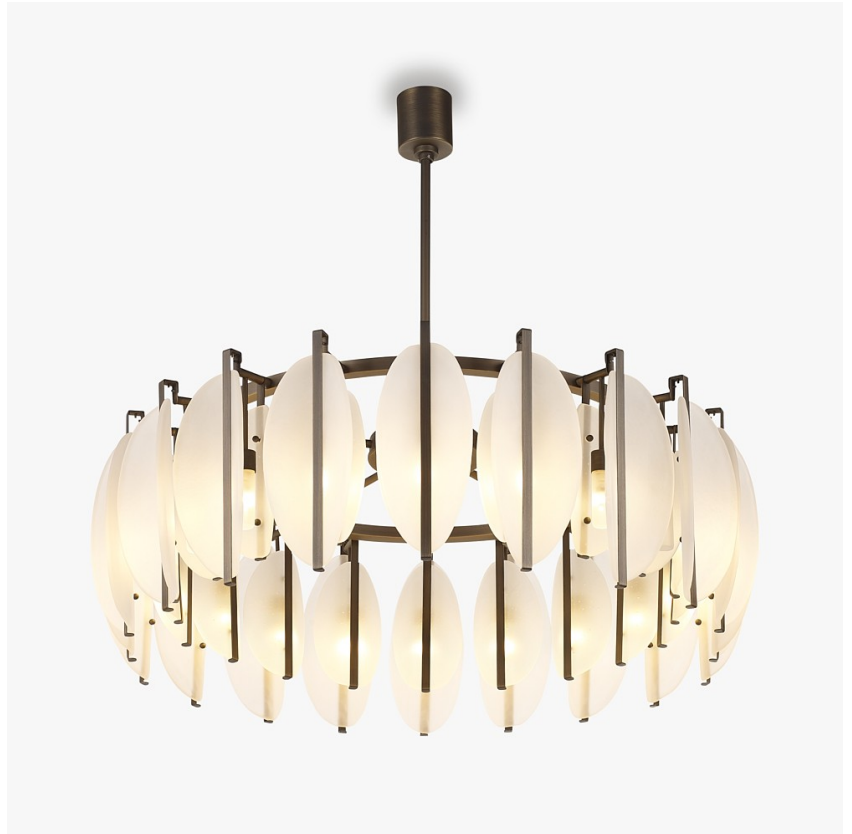
CL852 in Satin and Brushed Bronze