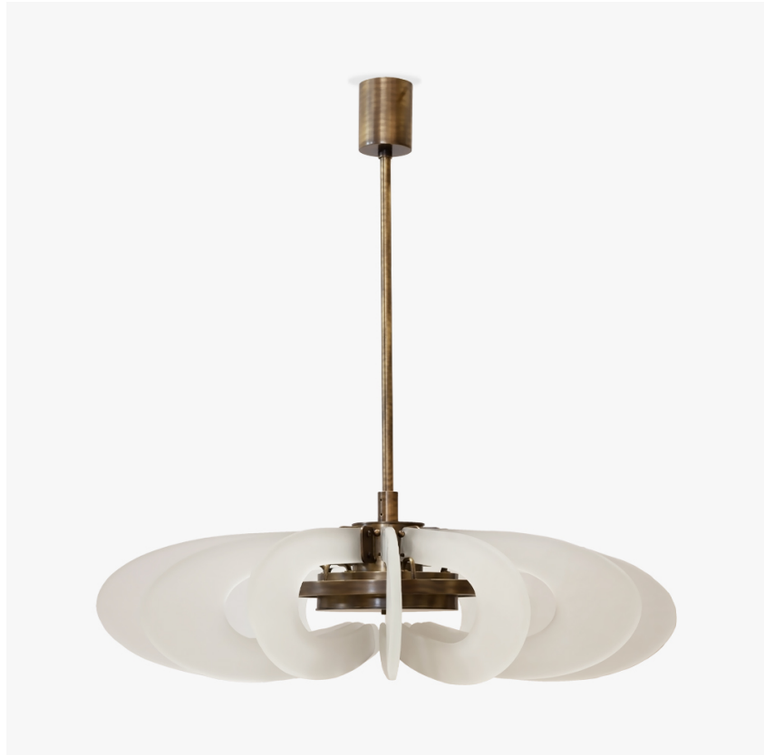
CL807 in Satin Glass and Brushed Dark Bronze

Vega's most daring design, the Magnetar ceiling light is the consequence of the discovery of a neutron star of the same name, a star which possess' powerful magnetic fields. The hand moulded glass fins visually represent the pulsating radio bursts emitted by this star. Unlike anything Bella Figura has ever created, this sculptural light conceals an integrated LED light source which emanates an ethereal glow from within.