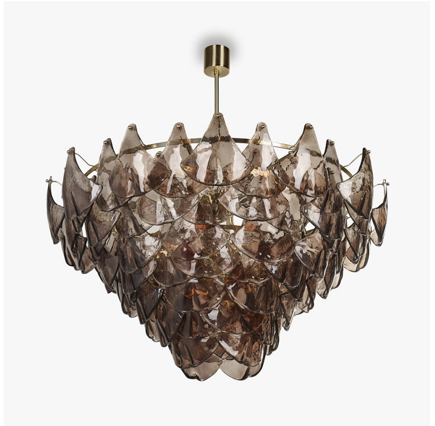
CL802-125 in Smoke & Brushed Gold