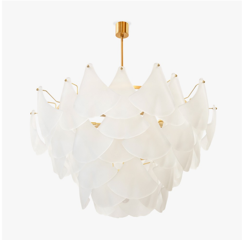
CL802-100 in Satin & Brushed Gold