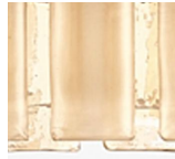
Lunar Champagne & Champagne Satin