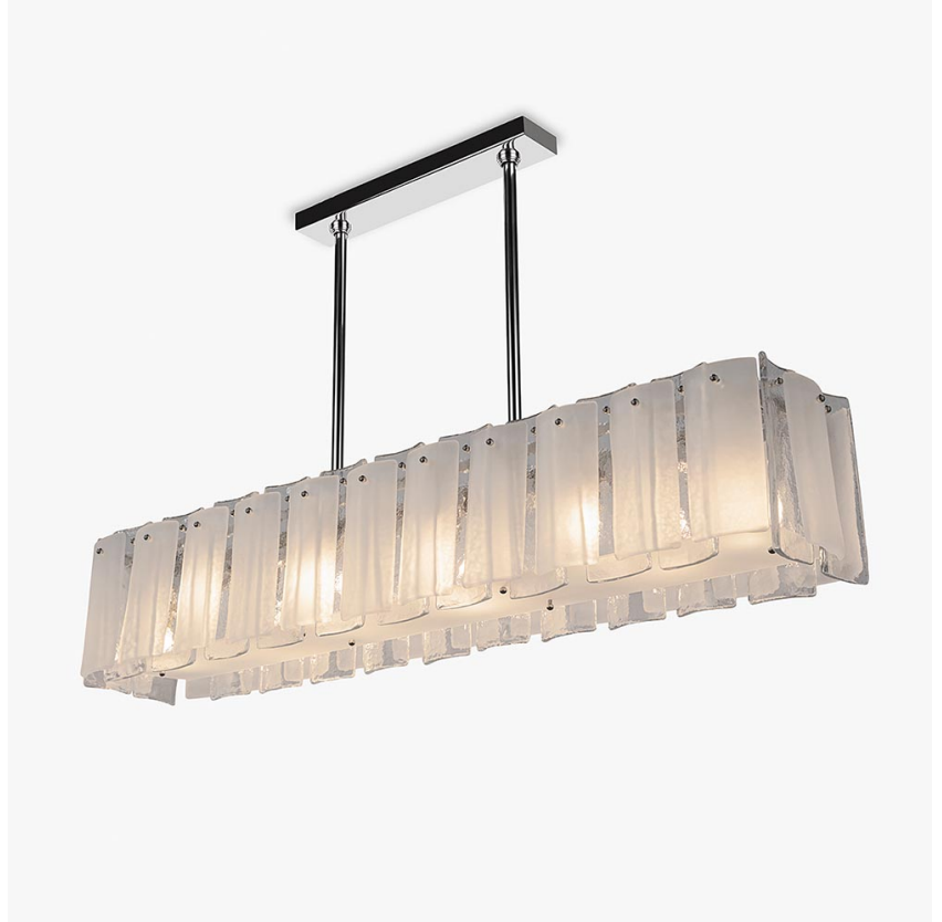
CL213-RECT in Satin with Clear Glass and Polished Nickel