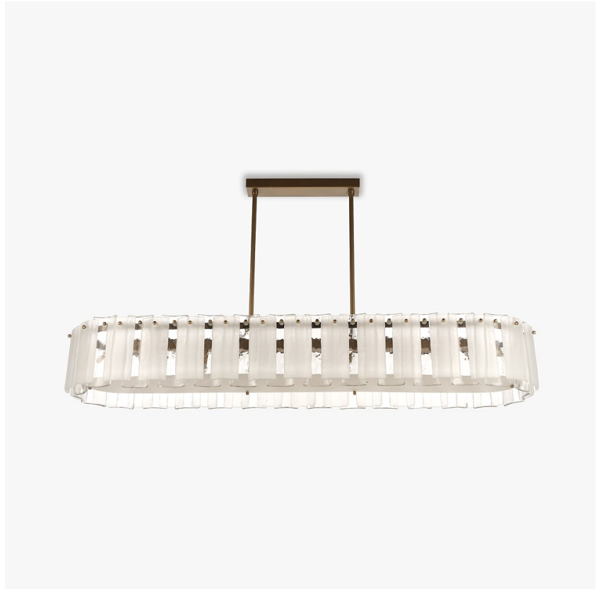
CL213-OB-150 in Clear & Clear Satin with Brushed Bronze