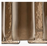
Lunar Bronze & Bronze Satin