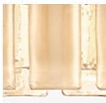
Lunar Champagne & Champagne Satin