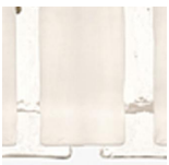
Lunar Clear & Clear Satin