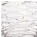
Clear Lead Crystal