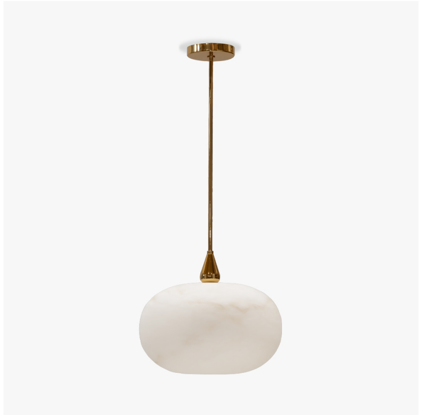
CL809 in Alabaster and Polished Gold

This enchanting pendant light is striking on the eye and by Jove, we love it. Jove gains its name from the earlier name for the sovereign deity Jupiter, but it is not only in name that our Jupiter and Jove pendants mirror each other. Both styles are carved from a solid block of alabaster and once the shape is revealed, so too is the intricate network of veins which weave their way through this rock. Alabaster has a smooth appearance which possesses dreamlike qualities when lit due to the varying degrees of translucency in the mineral veins, these natural characteristics deliver a captivating aura and a luxurious warm glow which elevates any space.