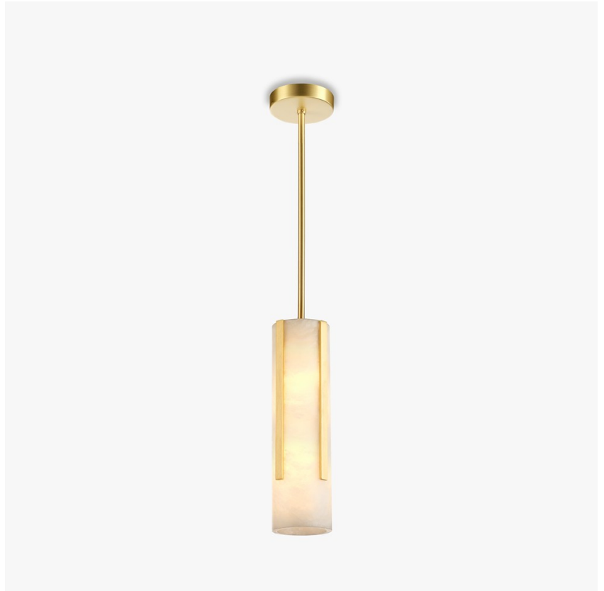
CL805-PEN-SM in Alabaster and Brushed Gold