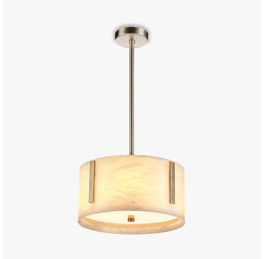
CL805-PEN-LA in Alabaster and Brushed Nickel