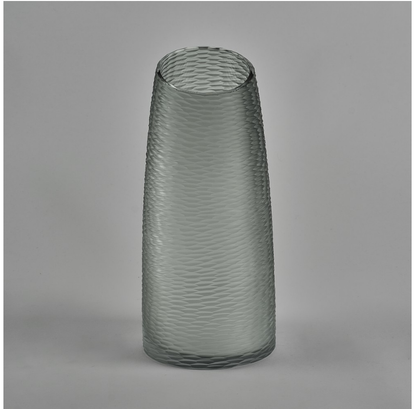
Harlequin Vase in Slate