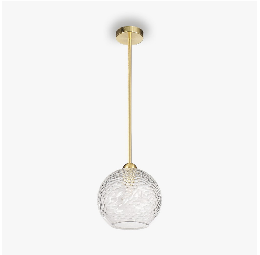
CL376 in Clear Battuto and Brushed Gold

The finest quality English lead crystal is carved in a fashion that mimics the patterns etched into the weather beaten walls of glacial caves. Drawing on the Murano glass craft of 'Battuto' whose name itself derives from the Italian word for 'beaten', our Glacier pendant and table lamp have every facet carved out individually by our English crystal experts. Use them individually or make use of our customisation service to group several together for a completely individual look.