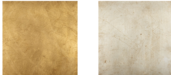
Antique Gold Leaf