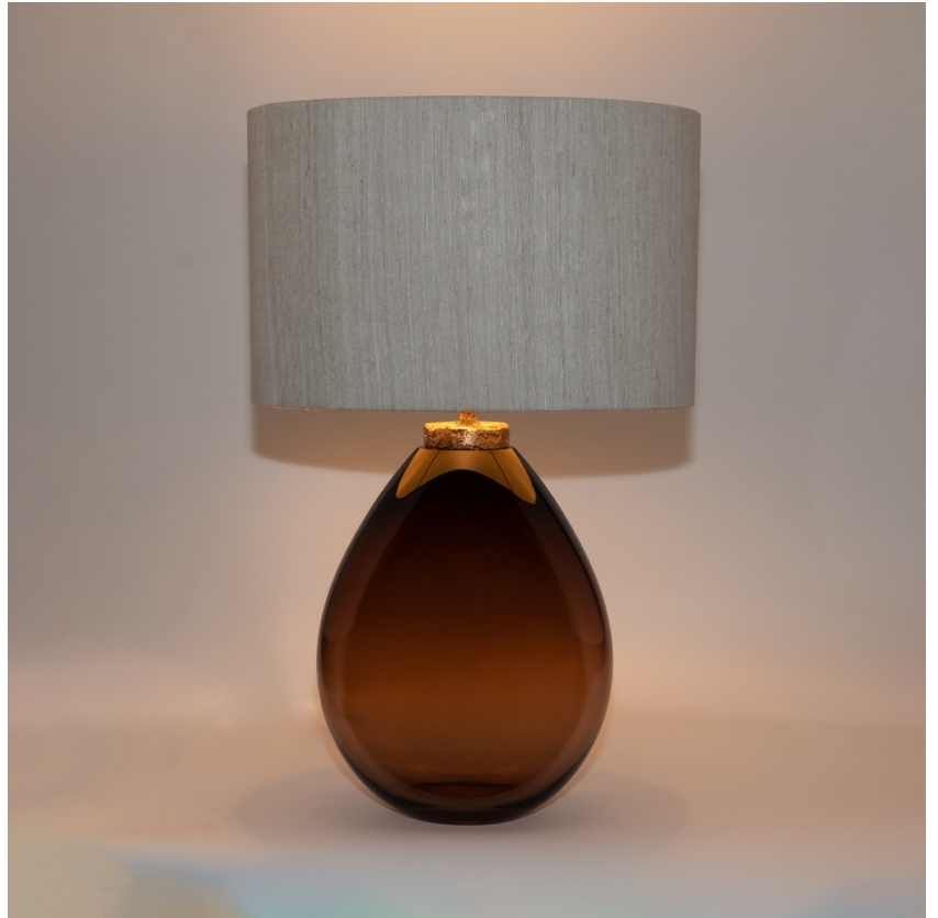
TL815 in Mahogany and Antique Silver Leaf with 16" Straight Oval Shade in James Hare 31625-03

There is no celestial body as prominent in the night sky than our humble Moon, its faithful presence is one we consider with wonderment and awe. The Gibbous table lamp is made in tribute to the mysterious spirit of our lunar companion; a generous hand-blown glass body in three shadowy tones paired with a textured and gilded neck which echoes the rocky surface of The Moon. Owed to its flattened form and slim oval lampshade, Gibbous is perfectly suited to console tables and narrower spaces.