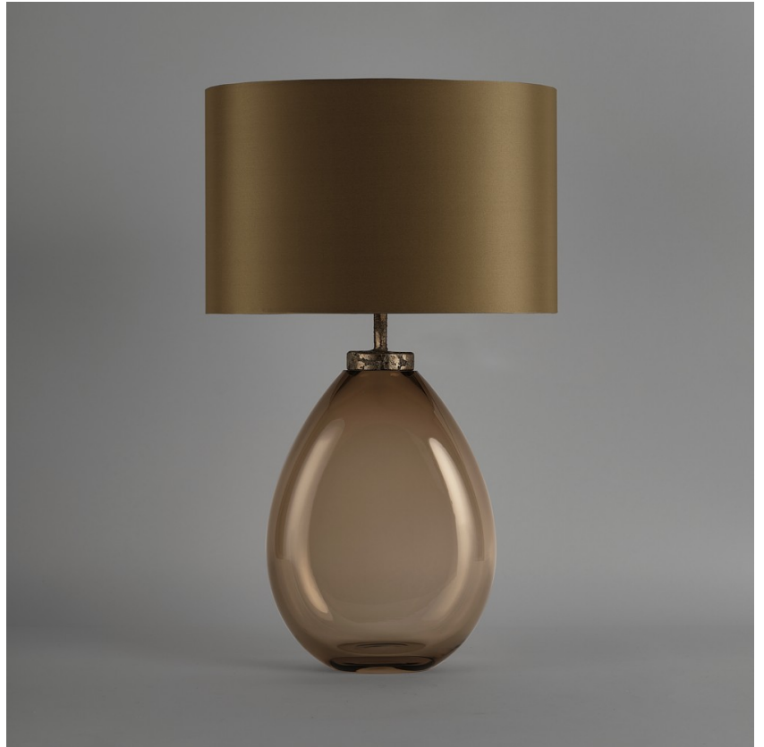
TL815 in Olive and Antique Gold Leaf with 16" Oval in Bennett's 1806W-310 Timber Wolf

There is no celestial body as prominent in the night sky than our humble Moon, its faithful presence is one we consider with wonderment and awe. The Gibbous table lamp is made in tribute to the mysterious spirit of our lunar companion; a generous hand-blown glass body in three shadowy tones paired with a textured and gilded neck which echoes the rocky surface of The Moon. Owed to its flattened form and slim oval lampshade, Gibbous is perfectly suited to console tables and narrower spaces.