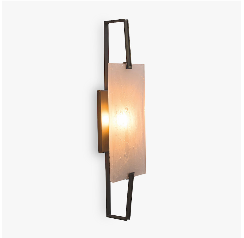
WL550 in Dry Ice and Brushed Bronze

UL (Underwriters Laboratories) test certificates available for the USA - will incur a surcharge