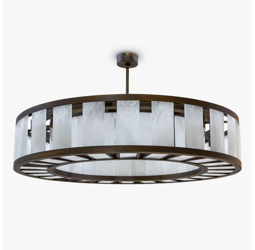
CL550-RO in Dry Ice and Brushed Bronze

IEC (International Electrotechnical Commission) test certificates available - will incur a surcharge UL (Underwriters Laboratories) test certificates available for the USA - will incur a surcharge