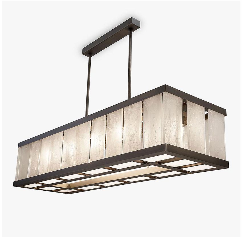
CL550-RECT in Dry Ice and Brushed Bronze

IEC (International Electrotechnical Commission) test certificates available - will incur a surcharge UL (Underwriters Laboratories) test certificates available for the USA - will incur a surcharge