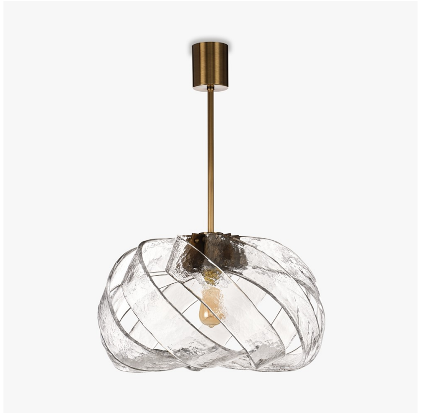
CL210 in Clear and Brushed Light Bronze

Our whirling Erté ceiling light is proof that inspiration can evolve from anywhere. Artist Erté is perhaps best known for his instantly recognisable graphic works which encapsulate the fashions of the Arts Décoratifs period in which he worked. The dancing limbs of this generous pendant light echo the flirtatious femininity of his designs and the synchronised movement of line within his work. Select glass in Clear for a glamorous glittering look or Frosted for an alluring glow to your interior setting.