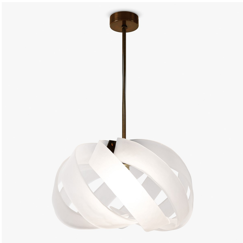
CL210 in Satin Glass and Brushed Light Bronze

Our whirling Erté ceiling light is proof that inspiration can evolve from anywhere. Artist Erté is perhaps best known for his instantly recognisable graphic works which encapsulate the fashions of the Arts Décoratifs period in which he worked. The dancing limbs of this generous pendant light echo the flirtatious femininity of his designs and the synchronised movement of line within his work. Select glass in Clear for a glamorous glittering look or Frosted for an alluring glow to your interior setting.