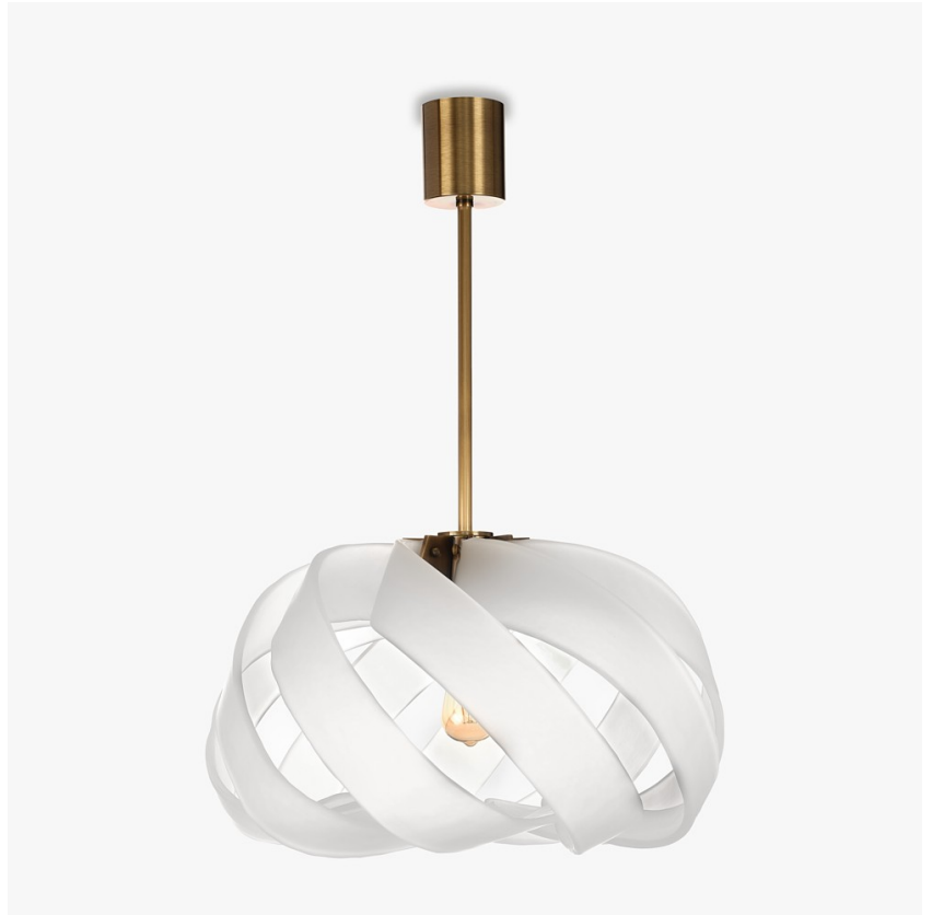
CL210 in Satin and Brushed Light Bronze

Our whirling Erté ceiling light is proof that inspiration can evolve from anywhere. Artist Erté is perhaps best known for his instantly recognisable graphic works which encapsulate the fashions of the Arts Décoratifs period in which he worked. The dancing limbs of this generous pendant light echo the flirtatious femininity of his designs and the synchronised movement of line within his work. Select glass in Clear for a glamorous glittering look or Frosted for an alluring glow to your interior setting.